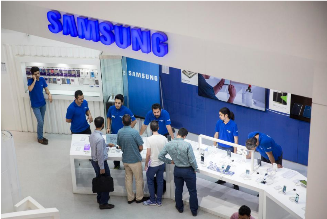
Samsung had the most allegations of fraud and corruption against it