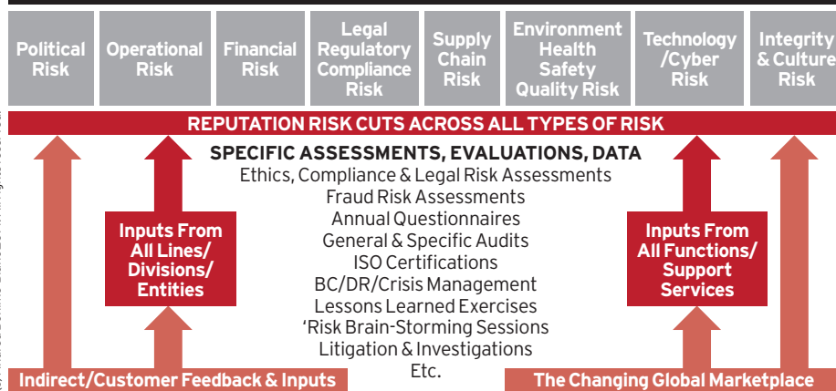
FIG 6: THE 'BIG BUCKETS' OF DEVELOPED ERM & REPUTATION RISK

(c) Andrea Bonime-Blanc 2014. All rights reserved.