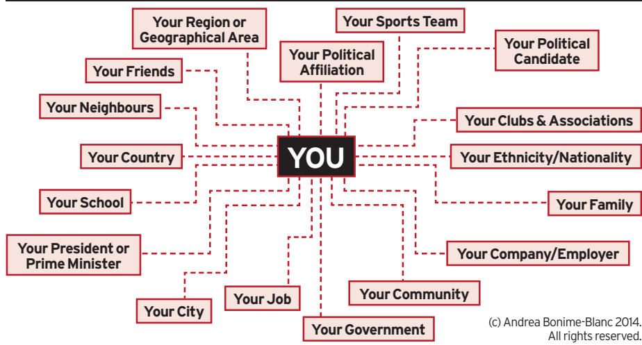
FIG 4: REPUTATION RISK & YOU